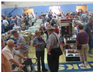
A packed hall greets the crowd.

Hope you left the lights on, as it's a full day on the road when you try to "Beat the Heat."