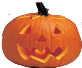
TABLE RESERVATIONS FOR TCA MEMBERS ONLY AT $10.00 PER TABLE - NO LIMIT

OPEN FOR THE PUBLIC FROM 10:00 AM - 3:00 PM