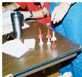
Art Lites' original and reproduction missiles.