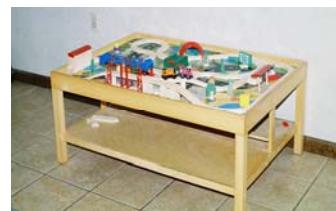
Brio table and set donated to Ronald McDonald House of NM by the Desert Division on behalf of the Rio Grande Chapter.