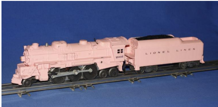
2037 Girls' Loco and Tender