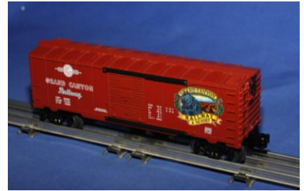
Grand Canyon Box Car