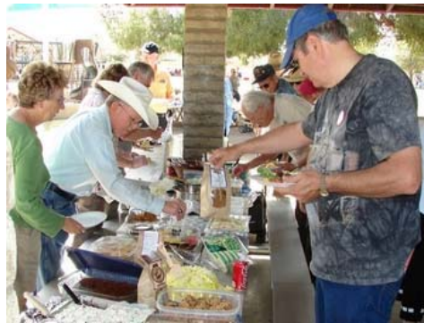
The Chow Line