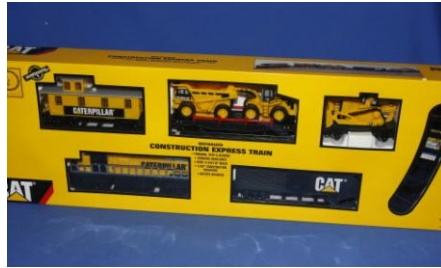
Caterpillar Construction Express Train