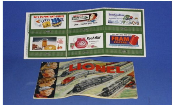
Lionel Uncut Billboards and 1951 Catalog