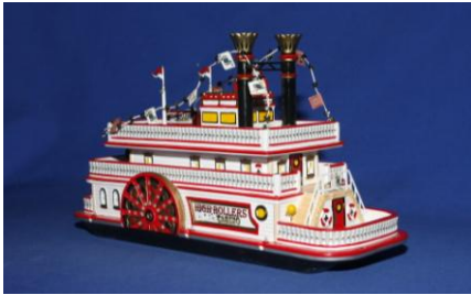
Department 56 High Rollers Casino

We request you enter lots of reasonable value and withhold those which would be classified as “junk” or decrepit used track. To be fair to all consigners, we are requesting a minimum opening bid of $5 per lot. Pictured below are some selected lots of which we are aware.