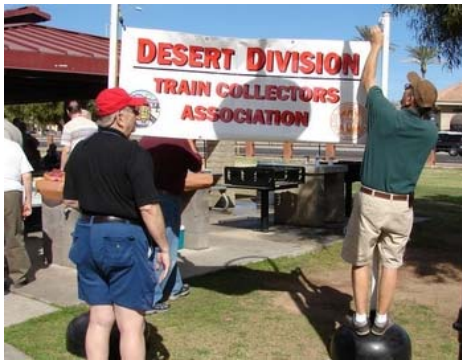
Hanging the Desert Division's Banner