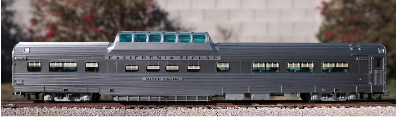
Atlas Budd Dome Coach "Silver Lariat"