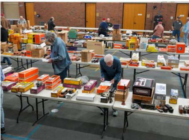
A room full of trains is always fun.