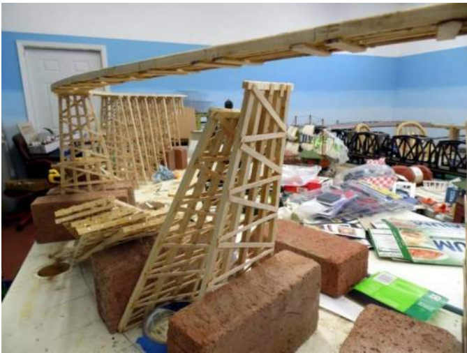
Figure 8. More Stringer and Bent Assembly