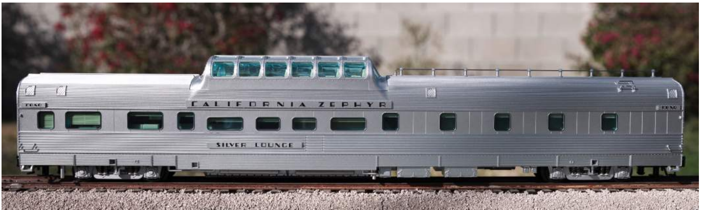
Atlas Budd Dome / Lounge / Crew Dorm "Silver Lounge"