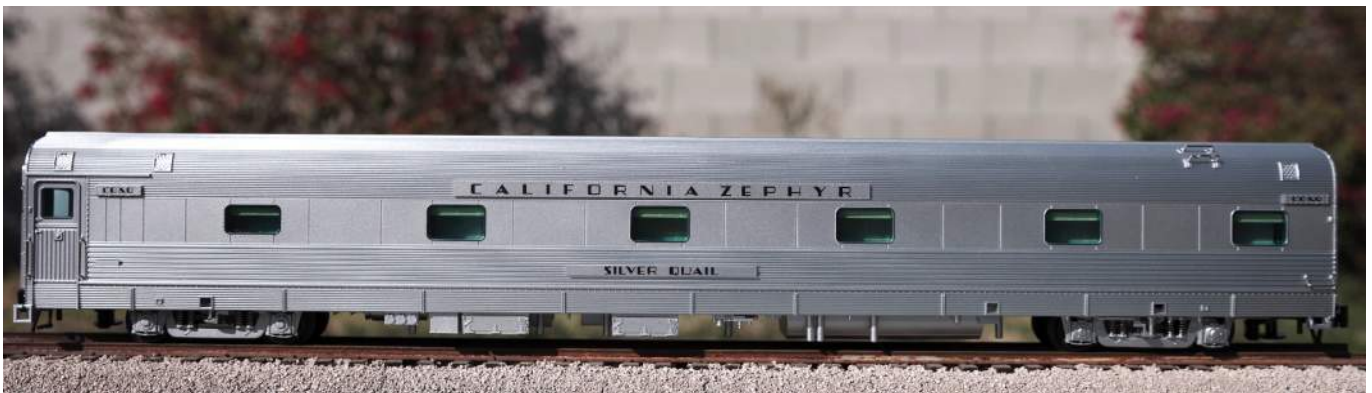
Atlas 6-5 Budd Sleeper "Silver Quail"