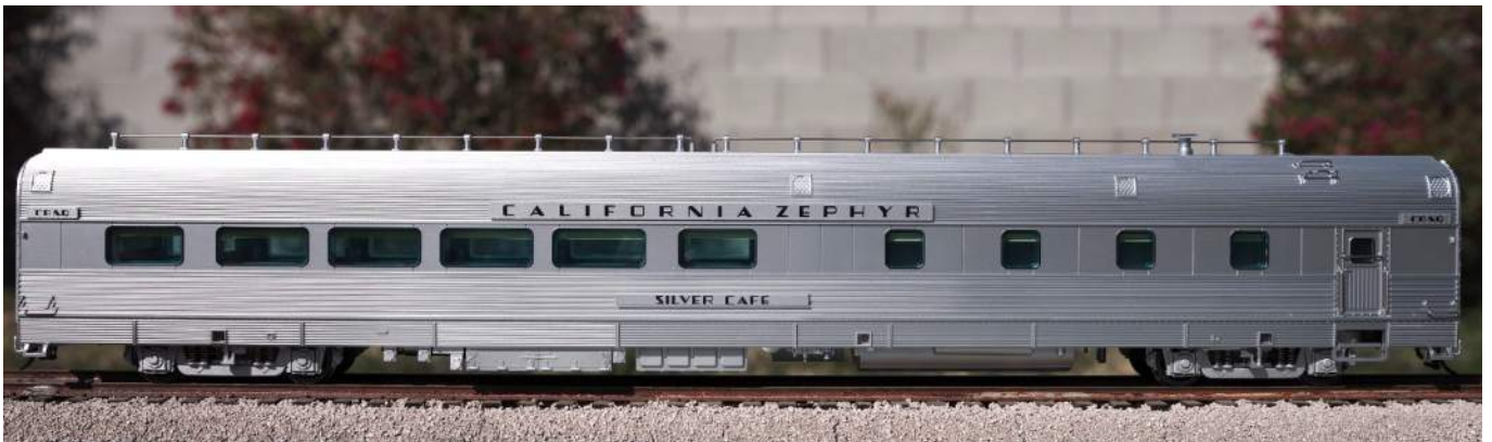
Atlas Budd Diner "Silver Café"