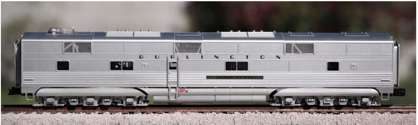
3 rd Rail E5 A and B Units "As-Delivered" with Full Skirting