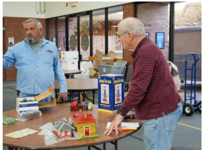
What lot do these go with?