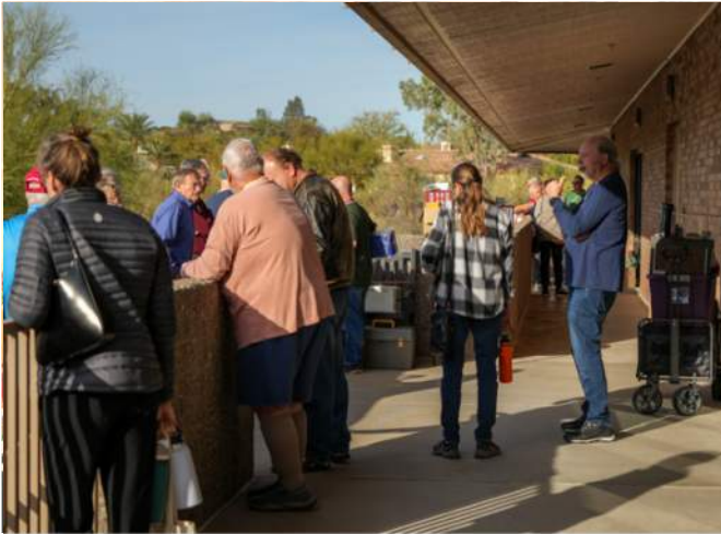
A patient crowd waits outside of room H-1.