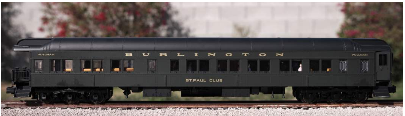
Golden Gate Depot Pullman Standard Observation