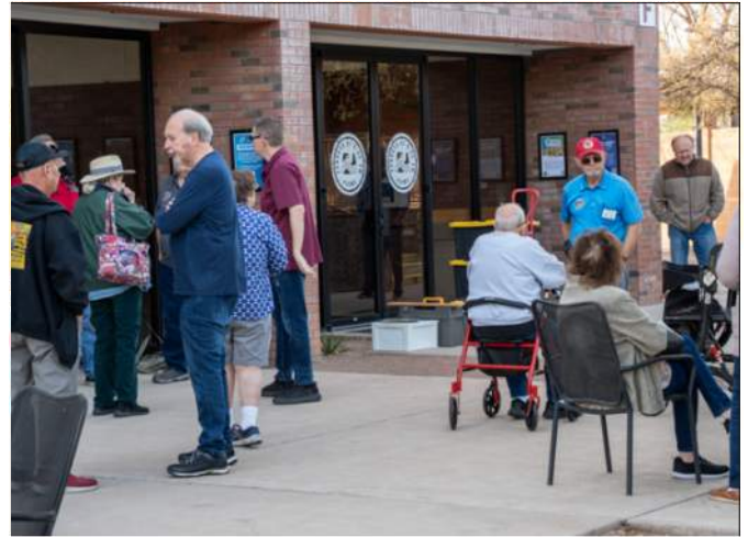
A slightly less patient crowd is now waiting outside of the fellowship hall!