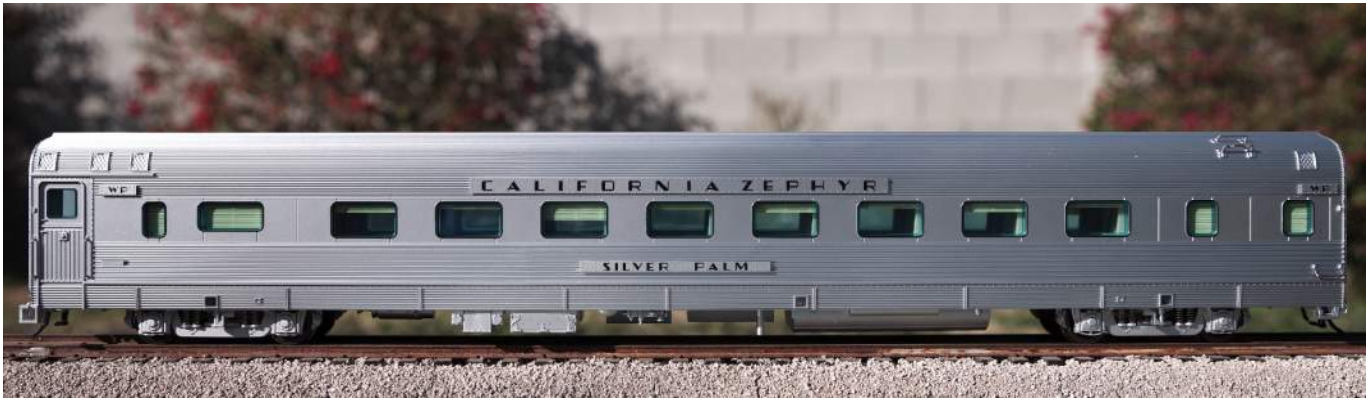
Atlas 16 Budd Section Sleeper "Silver Palm"