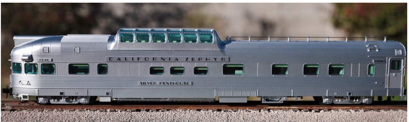
Atlas Budd Observation / Dome / Sleeper "Silver Penthouse"