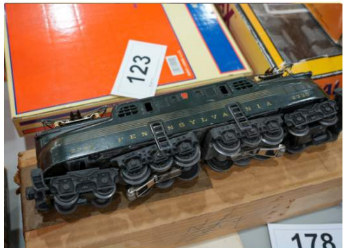
A gorgeous 2330 GG1 and the original box.