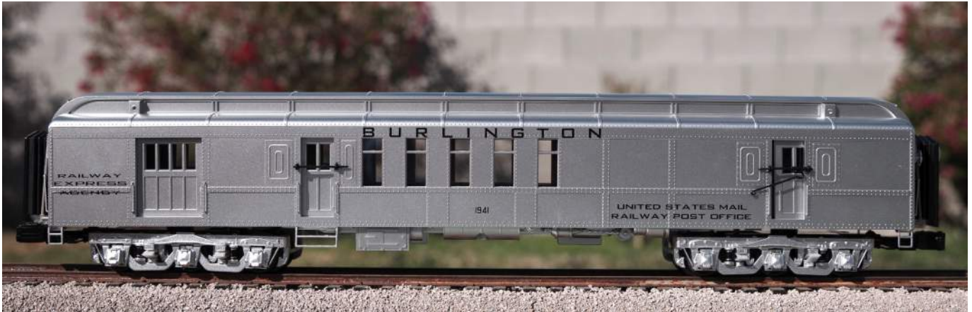
Atlas “Premier” RPO Custom Run by Berwyn’s Trains

The E5 was initially ordered to pull trains such as the “Afternoon Zephyr”, “Morning Zephyr”, “Nebraska Zephyr”, “Ak-Sar-Ben Zephyr”, “American Royal Zephyr”, and the “Exposition Flyer” which was a partnership between the CB&Q from Chicago to Denver, the DRG&W from Denver to Salt Lake City and finally the Western Pacific to Oakland California. Inaugurated in 1939, it was a precursor to the California Zephyr. Later the E5 would go on to be the primary power for such trains as the “Texas Zephyr”. My initial idea was to model a generic heavyweight era train loosely based on the “Exposition Flyer”. This train consisted of all heavyweight cars, so the Atlas Premier cars were a good start. I started a search to add other cars to this train and first addition included four 80 foot (20”) Golden Gate Depot coaches. I have learned over the years that when one puts their mind to finding items on eBay, one will find them. This set quickly filled out with more Golden Gate depot cars including an additional RPO, a diner, an open-end observation, and some Pullman Standard 12-1 sleepers in Pullman pool paint schemes. Suddenly, I was at 10 cars for this train even if it was a bit generic in the specific car configurations. In short, more than I was comfortable pulling with a single locomotive.