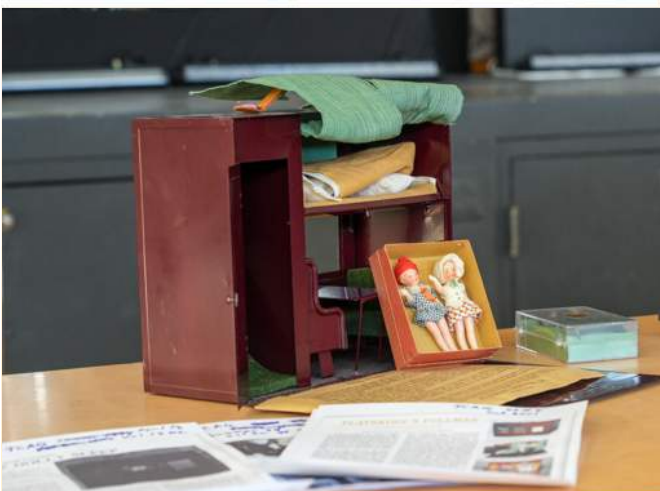
Irene Wasserman's Playskool Pullman car play set.