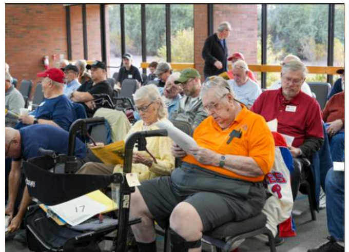
Quality auctions always draw a large crowd.