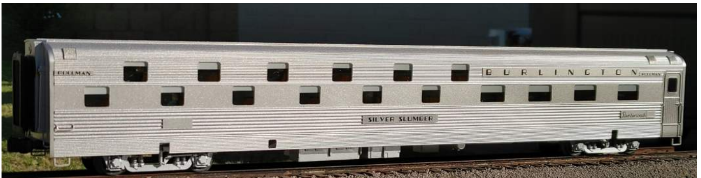
Golden Gate Depot Budd Slumbercoach "Silver Slumber"