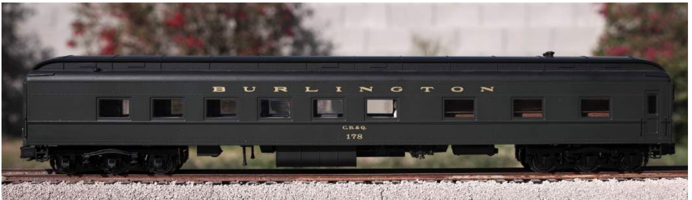
Golden Gate Depot Heavyweight Diner