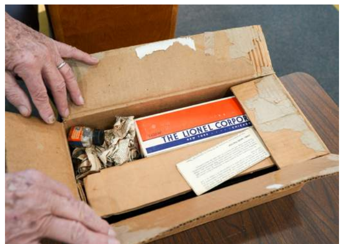
What's in the box? A hint - a 1950 mint condition 773 Hudson perhaps?