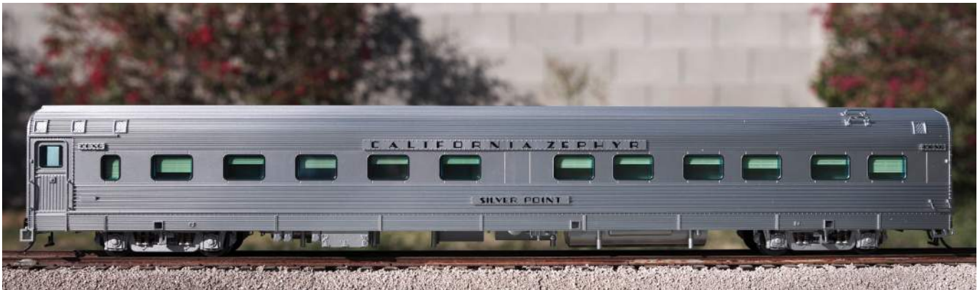
Atlas 10-6 Budd Sleeper "Silver Point"