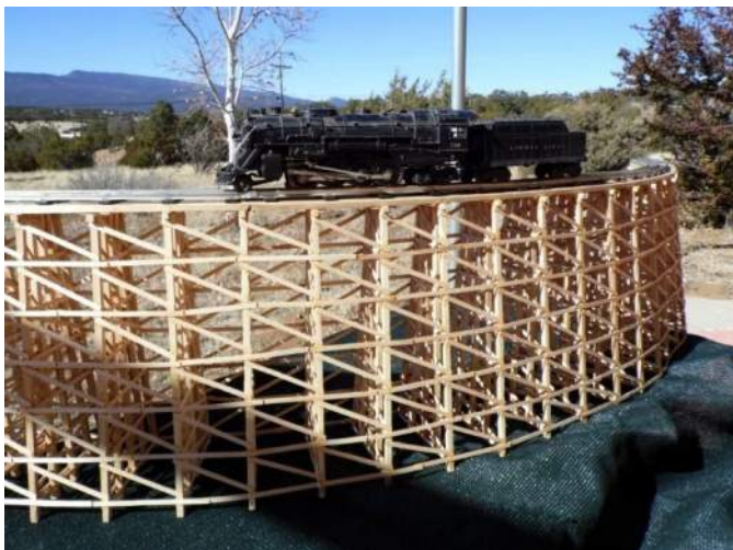
Figure 10. The Completed Trestle