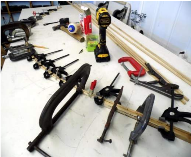
Figure 4. Second Strip of the Stringer Put in Place