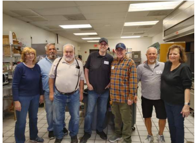
A special shout out to our awesome cooks who provided delicious soups and chili!