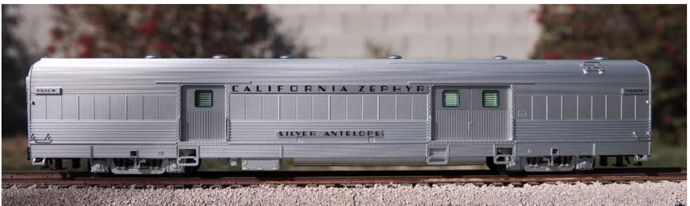
Atlas Budd Baggage Car

In closing, we often think of TCA as a "collector's club". Certainly, "collectors" is in the name, but TCA is such a broad tent that we have those who enjoy operating, modeling, and the prototype. Perhaps there is a little of all these interests in all of us. I know that my during my time in TCA I have come to appreciate just how varied and interesting our membership is when it comes to this wonderful hobby.